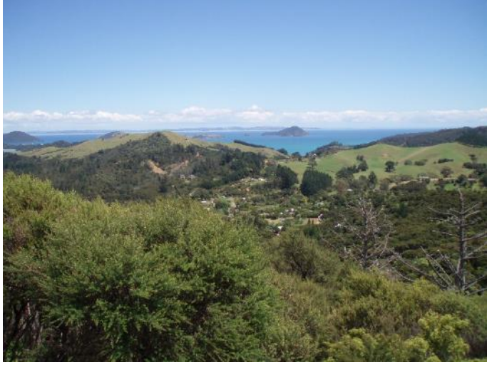
The view from the Eyefull Tower